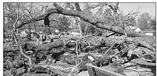
Yet another large tree falls at Mangum Manor Park