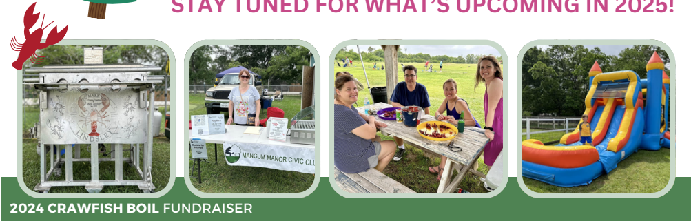
2024 CRAWFISH BOIL FUNDRAISER