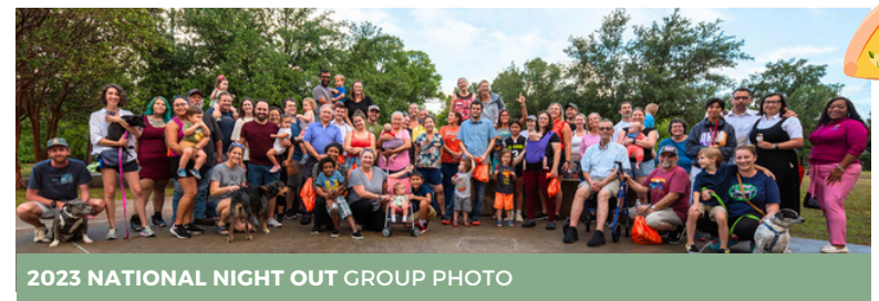
2023 NATIONAL NIGHT OUT GROUP PHOTO

We had so much fun with NNO last year, so let's do it again! Join us in the park for pizza & ice cream, prizes, and the neighborhood photo, which will be taken at 6:30 PM.