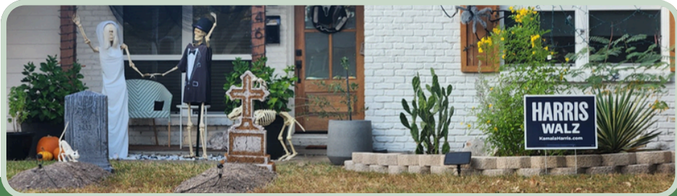
HALLOWEEN 2024 DECOR WINNER - CONGRATULATIONS TO THE NEWLY WEDS