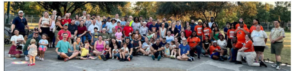
2024 NATIONAL NIGHT OUT GROUP PHOTO