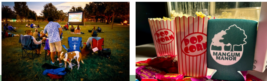
CIVIC CLUB DUES HELP PAY FOR EVENTS LIKE THESE!

We held voting on our Facebook page for what movie to watch. The winner was “The Wild Robot,” and it was great. The weather was perfect and the popcorn was delicious.