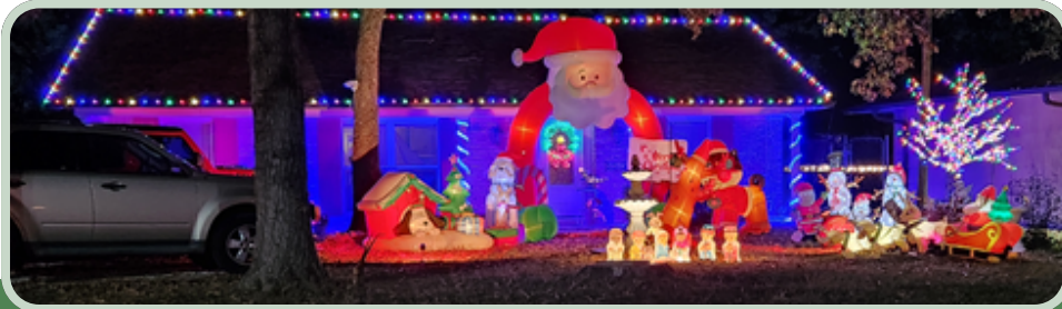
CHRISTMAS 2024 DECOR WINNER - CONGRATULATIONS